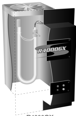
R4000GX UV Air Purifier

The Sanuvox R1700GX and R4000GX In-Duct Purifier will purify a portion of the air moving within the duct at any given time. The air within our homes continually circulates through the ventilation system every minute of every hour of every day. Sanuvox In-Duct purifiers rely on the re-circulation of the homes ventilation to bring the overall level of contamination down. After an hour or two of being installed, the home will have circulated the air through the in-duct purifier enough times as to bring the home's overall contamination down drastically.